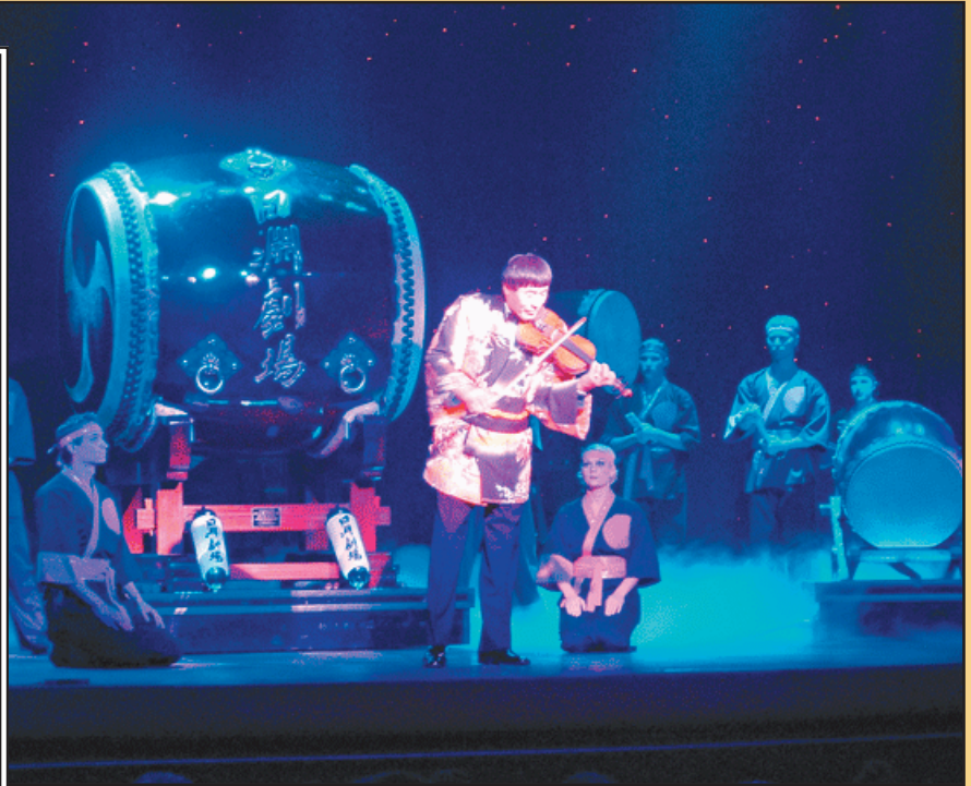
Shoji Tabuchi's native Japanese Taiko drums are said to recreate "the origin of the spirit of the Japanese people."

You will be dropped at the door to the shows; no long walks, no long lines, no waiting.